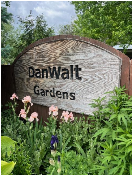
Dan Walt Gardens