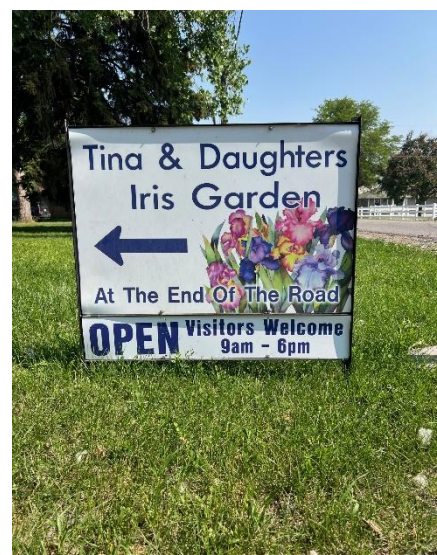
Tina and Daughters Iris Garden