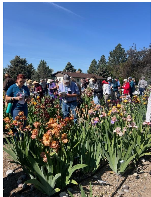
Muriels's Iris Garden