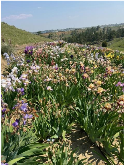
Eagle Ridge Iris Garden