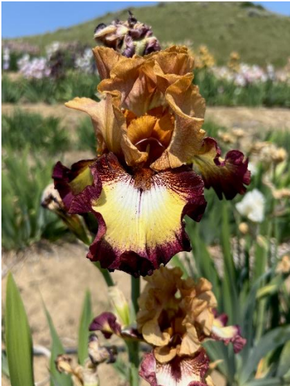
REFLECTS DU SOL