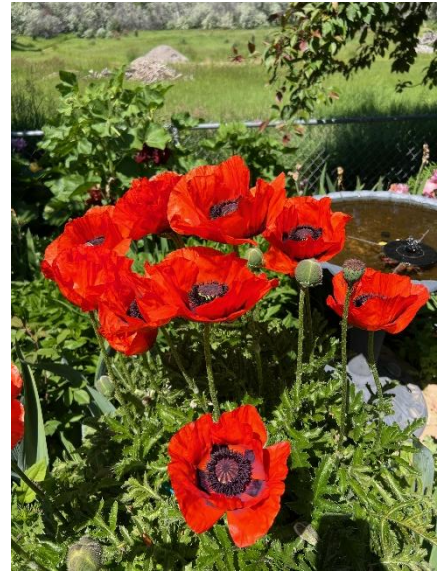
Poppies at Cindy St. Charles Garden