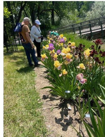
Iris Display at Montana Zoo

NOTE: The photo pages of the iris that will possibly be in the auction are being sent in a separate email.